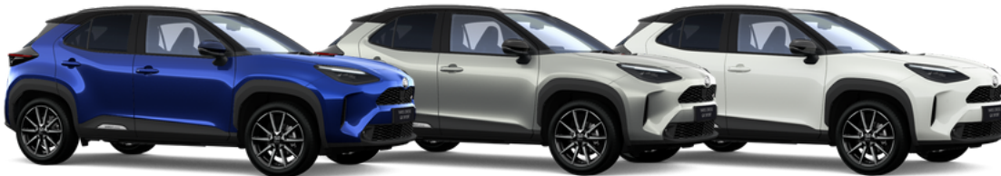
Juniper Blue Bi-tone (M20) **