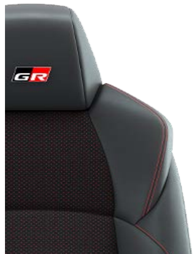
GR SPORT suede and synthetic leather upholstery with red stitching (GR SPORT) (EC20)