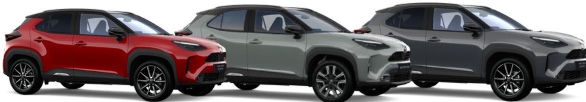
Pearl Red Bi-tone (2SZ) *** *GR SPORT Only*