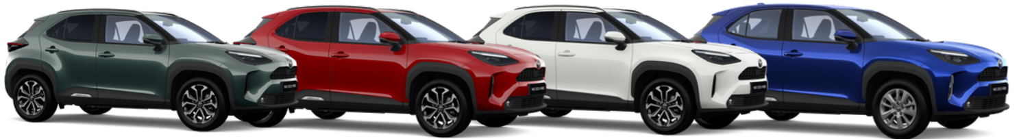
Forest Green (6X7) **