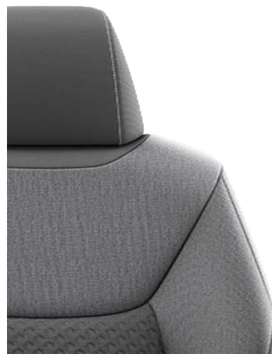
Black fabric upholstery with light black roof lining (Luna Sport) (FC20)