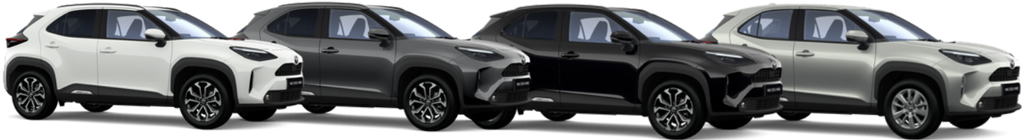
Pure White (040) *